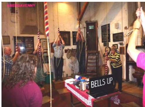
Ringling at St Mary's, Abergavenny

Another remote location with deep-set bells that were quite difficult to hear provided us with a challenging forty-five minutes.