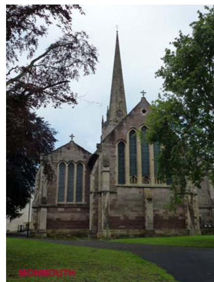
St Mary the Virgin, Monmouth

Sadly we were not able to make any comparisons with the next six as this proved to be the curse of all tour organisers: we found ourselves locked out. Fortunately for both tourists and the local landlord this setting was less remote and, while fruitless attempts were made to gain access, a source of refreshment was readily available. After a short break and before a convivial meal at the local Weatherspoon's, the last stop was St Mary the Virgin in Monmouth (8, 17cwt). The following morning this tower benefited from the attendance of nine hardy tourists to boost their Sunday Service band.