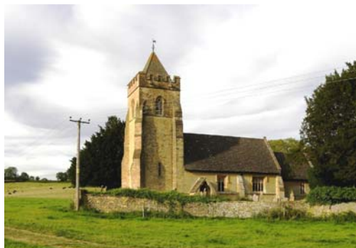
St Mary the Virgin, Salford, Oxon

The Minimus Competition took place in lovely sunny evening weather on the delightful light 5 at St Mary the Virgin's Church, Salford, Oxon.