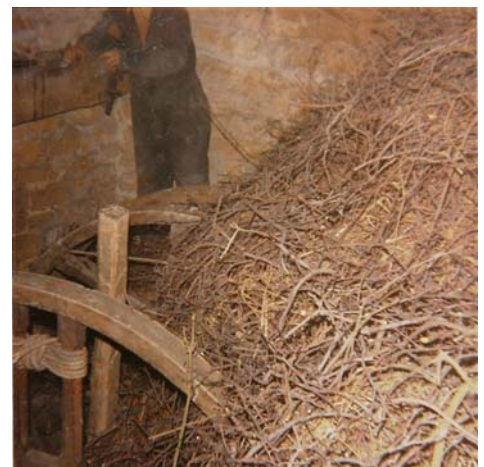
Another view, with (probably) Malcolm in the background (Clint taking the shots).