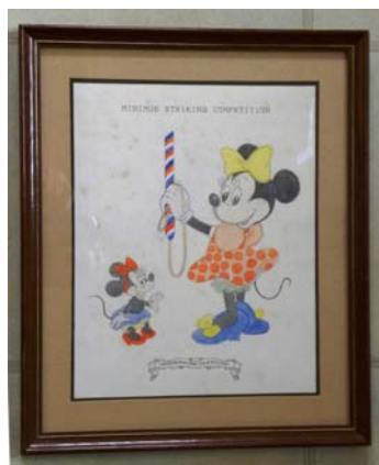
The Minimus ('Minnie Mouse') Trophy

first; then Moreton, 'the Committee', a 'scratch' band, Mickleton and the 'BJ and the ringing band'. Three minutes were allowed for a practice, then five plain courses of Minimus (120 changes) for the test piece. As might be imagined, it didn't take long to get through all six teams. Some teams decided to ring just four bells instead of five, but this was entirely valid for a Minimus competition!