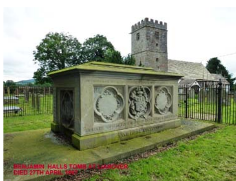
Sir Benjamin Hall's tomb at St Bart's, Llanover

We continued down river to St Bartholomew in Llanover (5, 6cwt) where we were able to change the tune to St Simon's Doubles. Here we also found an historic ringing connection, as it was the site of the grave of Sir Benjamin Hall, a local worthy and politician after whom 'Big Ben' was named. As befitted a renowned 'larger than life' character the mausoleum dominated the pretty churchyard.