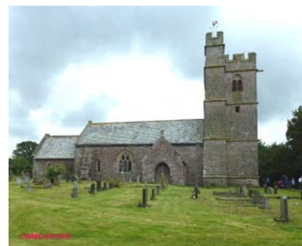
St Clement's, Cwmcarvan

We continued down river to St Bartholomew in Llanover (5, 6cwt) where we were able to change the tune to St Simon's Doubles. Here we also found an historic ringing connection, as it was the site of the grave of Sir Benjamin Hall, a local worthy and politician after whom 'Big Ben' was named. As befitted a renowned 'larger than life' character the mausoleum dominated the pretty churchyard.