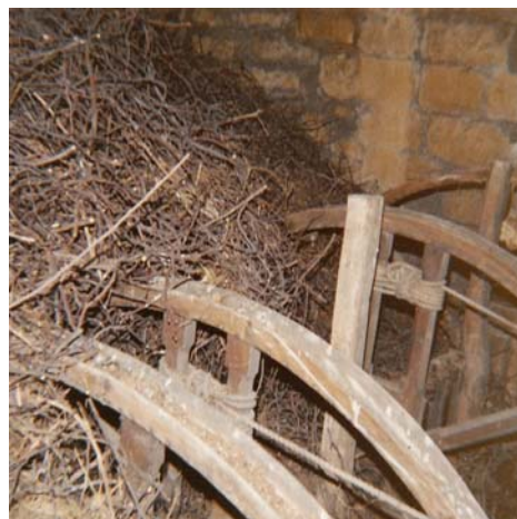
A huge pile of twigs.