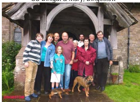
The 'advance party' at Dingestow

It was an early start on the Saturday for those who decided to take the day trip option. The first tower was St Teilo, Llantilio Pertholey (6, 12cwt) in a picturesque riverside setting beneath the Skirrid Mountain, where Grandsire and Stedman were successfully completed. An attempt at Cambridge Minor was of somewhat questionable quality.