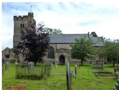
St Mary's, Usk

The second tower was the esteemed St Mary's in Abergavenny 10, 25cwt), an ambitious choice for a daytrip without guaranteed numbers. However,