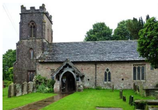
SS Dinigat & Mary, Dingestow